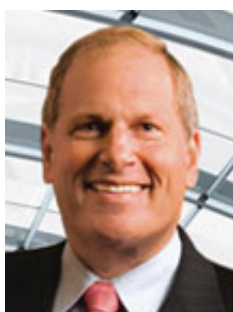
David M. Cote Chairman and CEO of Honeywell

The gala honored three leaders from the manufacturing, engineering and construction, and industrial gases industry sectors: David M. Cote, Chairman and CEO of Honeywell; David T. Seaton, Chairman and CEO of Fluor; and Stephen F. Angel, Chairman, President, and CEO of Praxair. Raj L. Gupta, Chairman of Avantor Performance Materials and Senior Advisor at New Mountain Capital, served as the gala's chair and host. Read more about the gala.