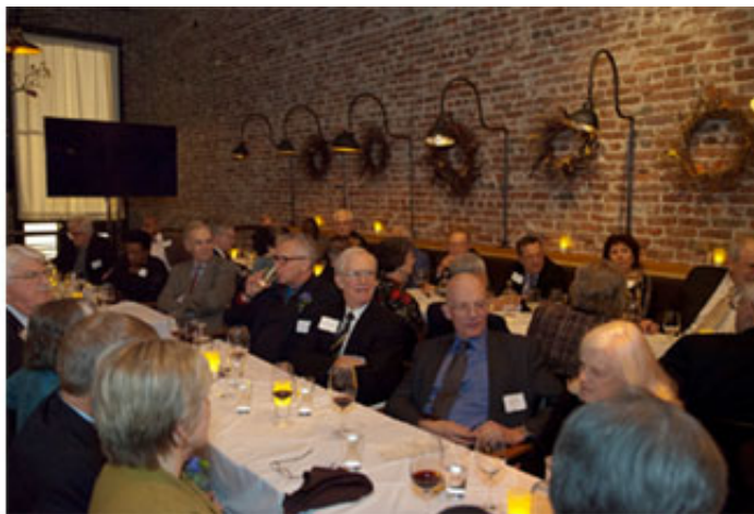
Members of the Foundation Board of Trustees enjoy the dinner and listen to toasts at AQ Restaurant and Bar.